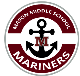
Mason Middle School