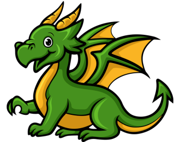
Donelson Hills Elementary