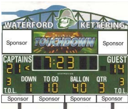
Figure 4- Scoreboard