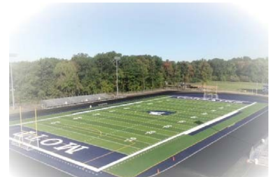
Figure 1 - High School Football Stadium - Mott

Send personalized messages to your student or athlete!