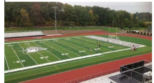
Figure 2 - High School Football Stadium - Mott

School & Community Services | 248.706.4868 501 N. Cass Lake Road, Waterford, MI 48328 scs@wsdmi.org