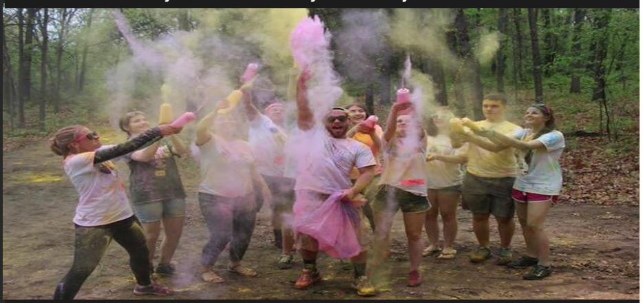
Color Blast 5K! at Hess Hathaway Park, Waterford